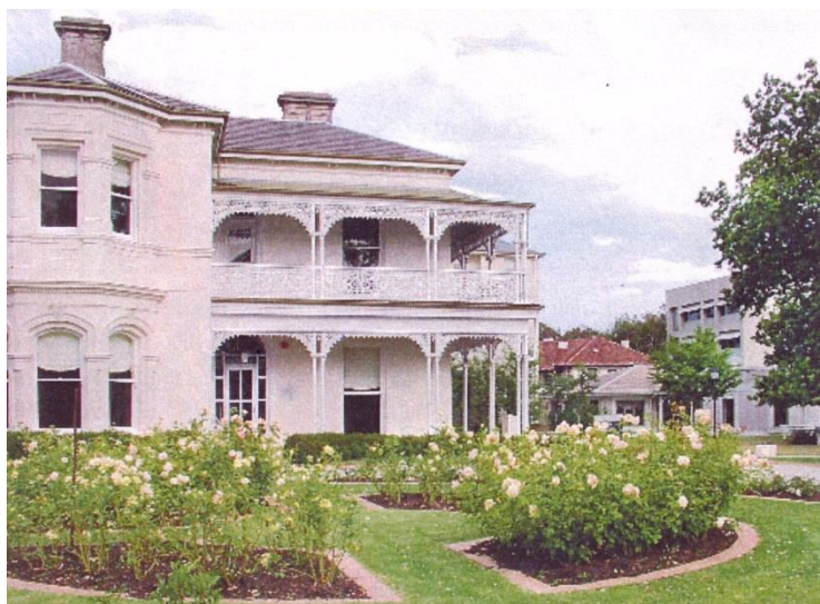
Treacy Conference Centre